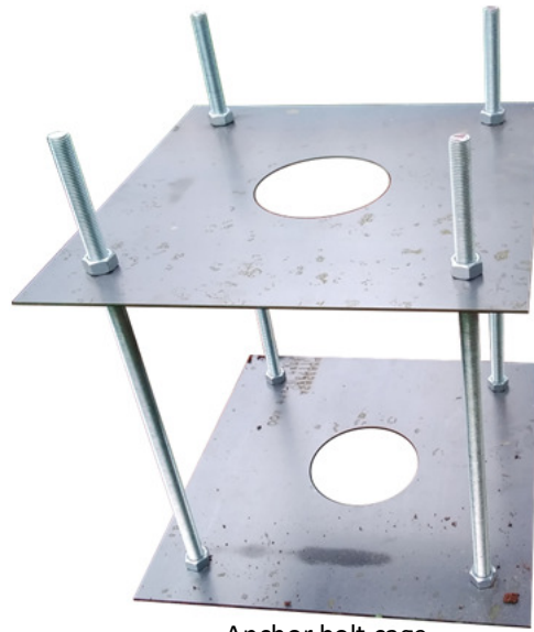
Anchor bolt cage